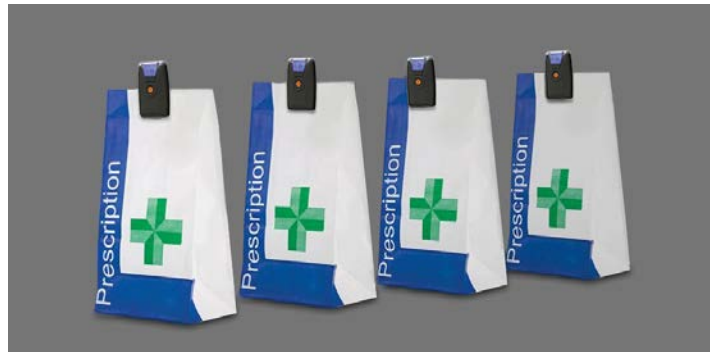
Figure 7. scripClip is available in several form factors. Above is the bag clip version. Hanging bag versions are also available. scripClip installations are offered in any combination of these form factors.

An experienced pharmacy operations consultant can provide advice on improving your workflow and calculate your expected ROI when implementing will call automation in your pharmacy.