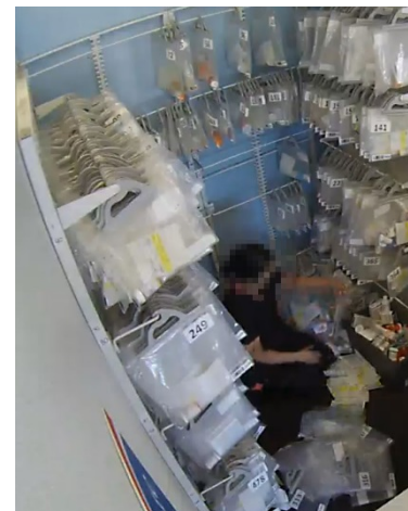
Figure 6. RTS before scripClip. Bags are individually checked for targeted date.

The following table examines how the level of ‘saturation’ (i.e. the percentage of bags in will call that have exceeded their ‘pull dates’ compared to the total number of bags in will call. In a manual methodology that examines all bags for their fill dates, the more ‘saturated’ the will call, the more efficient this methodology appears. However, keeping the will call area saturated creates a negative impact by increasing filing times and regular customer search times due to the increased number of total bags cluttering up will call. The amount of impact to these other areas of workflow due to keeping the will call area ‘saturated’ was not studied in this white paper.