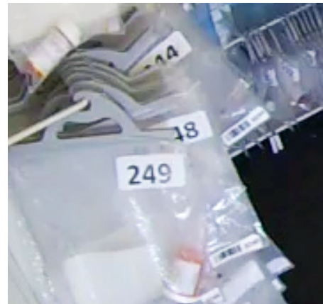
Figure 3: A Numeric Filing System

Even with this efficient system, misplaced packages took over 12 minutes of time to resolve and return to stock remained a lengthy process that was infrequently performed because it was considered a tedious, labor intensive task.