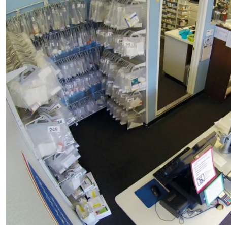
Figure 2 Pharmacy Will Call Before scripClip Installation

Even with this efficient system, misplaced packages took over 12 minutes of time to resolve and return to stock remained a lengthy process that was infrequently performed because it was considered a tedious, labor intensive task.